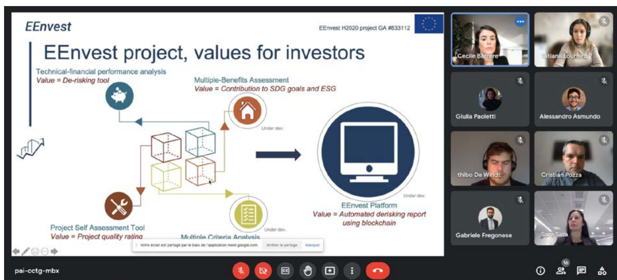
Figure 2: Picture of the workshop n. 2

The workshop aroused interest among the participants on seeing the further steps and evolution of the platform. In order to do so, the participants were offered to become Pioneer users of the platform, meaning that they will be further involved in its fine tuning as well as for its early testing as soon as a first beta release will be available, in which our partners have been working on.